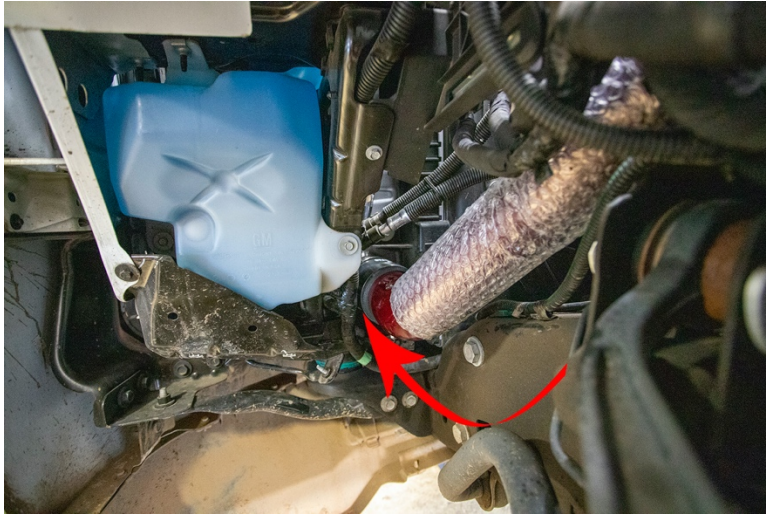
12. Seat into bottom boot first to ensure a solid connection at that location then into turbo side.