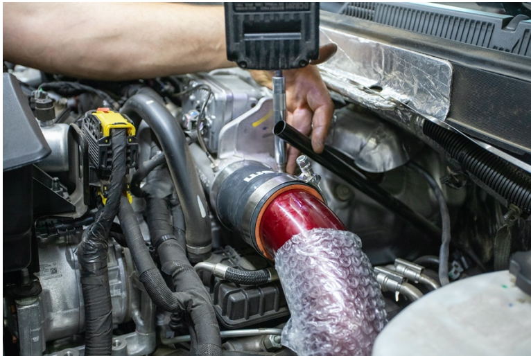
13. Check for proper engagement of pipe at both boots and tighten all clamps making sure that the clamps are placed just behind the pipe bead roll and square to prevent boost leaks.