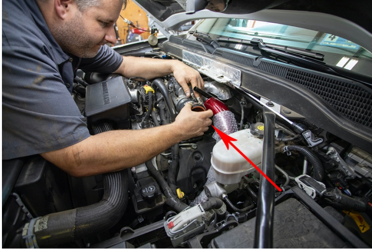
11. Install reducer boot at turbo