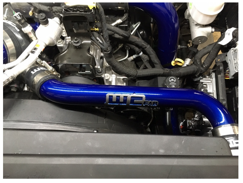
Any Questions, Comments, or Feedback?

10. It is suggested to check the coolant level and the clamps after the first few heat cycles to ensure leak free operation.